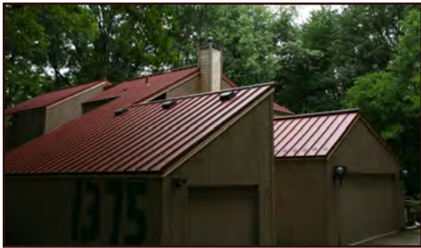
Standing Seam Aluminum Roof

There are literally dozens of different “looks” and “feels” that can be achieved with metal roofing—from the traditional standing seam look, to the old-world tile look or the beauty of shakes, to the more agricultural corrugated look. The variety of attractive metal roofing profiles is one of the great advantages of the industry. No matter what the style or look of your home, there is almost certainly a metal roof system out there that will complement it perfectly! Unfortunately, the variety of profiles is sometimes one of the industry’s detriments as well because it can lead to improper products being used for less than ideal applications. The following section should help you make an informed choice about the product that will work best, both aesthetically and functionally, for your home.