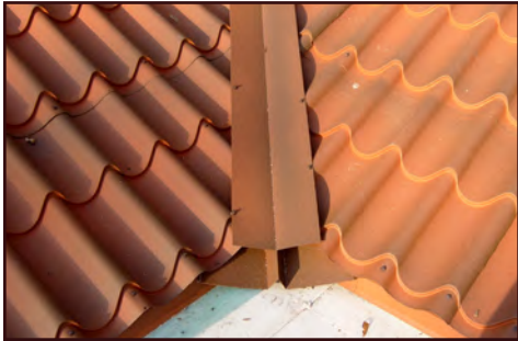
Exposed Through-Fastened Tile profile Steel Roof

Also since metal shingles look more like dimensional standard shingles, some homeowners choose them for their ability to blend in with a more modest neighborhood look. Like the shake profiles, the shingle metal roof systems are modularized panels fastened to the roof deck most commonly with a clip system, or sometimes with a nailing flange formed into the top of the shingle.