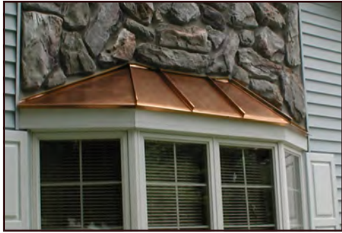
Copper Roof accent