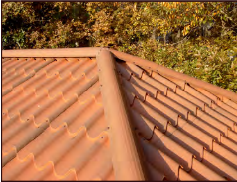
Through-Fastened Tile style Steel Roof

In most cases, clip-fastened panels are designed so that the clip and fastener are concealed (concealed fastener system). The fastener can also be concealed on certain types of through fastened panels as well. Some products with concealed fasteners may use a combination of through fasteners and clips. Both through-fastened and clip-fastened systems may be architectural or structural.