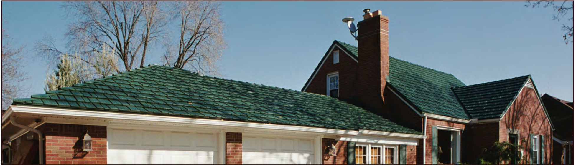
Above and Below: Aluminum Roof

There are other metals available for roofing as well including rolled zinc, stainless steel, terne-coated steel, terne-coated stainless, and titanium. Generally, roofs made from these more exotic metals will be architect-specified and will be custom-formed by a fabricator for a particular application. If you have interest in one of these more specialized metals, contact metal roofing manufacturers to check on availability and suitability for your end use.