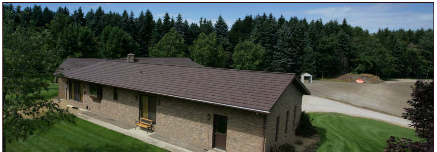
Right: Aluminum Roof