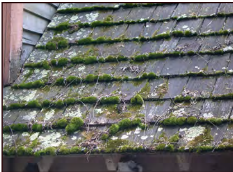
Wood Shake with moss growth

Many of the most popular roofing materials today are chosen because of their price, not their longevity. These roofing alternatives, while initially attractive, quickly lose their appeal as they begin to deteriorate. Temporary roofs are, initially, less expensive than permanent roofing systems. But when you consider the cost of periodic re-roofing, loss of energy efficiency, and potential damage due to weather, the cost of temporary roofing becomes astronomical over the long haul. That is why many people are avoiding temporary roofing materials. Let's look at the options though.