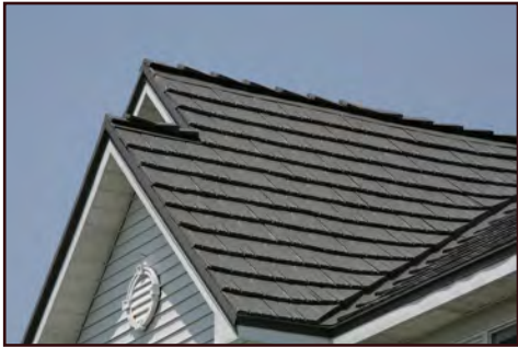
Shake profile Aluminum Roof